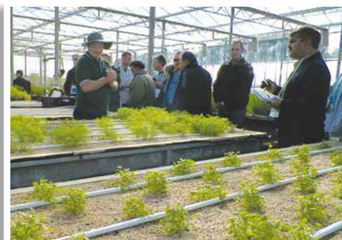
Conference delegates were very interested in the irrigated sand beds of coriander, at Freshzest.