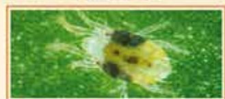
TWO SPOTTED MITE