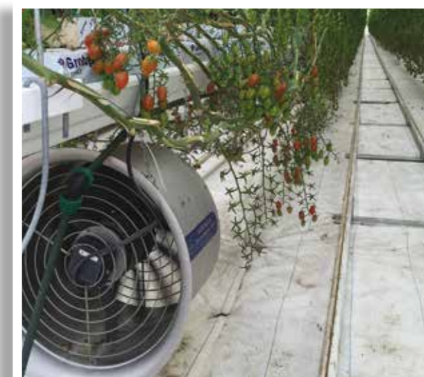
Air circulation with HAF fans under raised hanging gutters keeps the perfect atmosphere throughout the greenhouse.