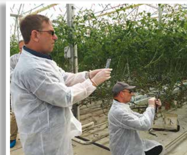
PCA Conferences give rare & privileged access to high-tech hydroponic & greenhouse farms.