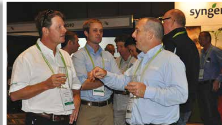
The trade display was a hive of activity sharing information & ideas.

Or visit www.protectedcroppingaustralia.com