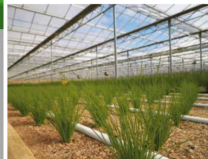
Freshzest grow glasshouse chives in irrigated sand beds.

Recognising and celebrating industry achievement and excellence, the PCA acknowledge leaders in the community. For all the winners, see page 18 - 19.