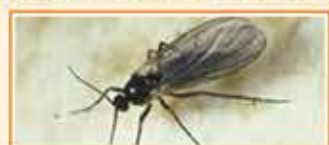
FUNGUS GNAT / THRIPS