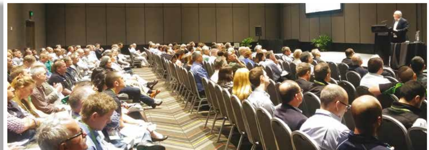
Delegates gathered together for the Key Note and opening talks, then split into smaller groups picking their favourite subjects out of the full speaker program. The proceedings book fills in the gaps for what they may miss or in lieu of taking notes.