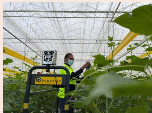
Family Fresh Farm in action