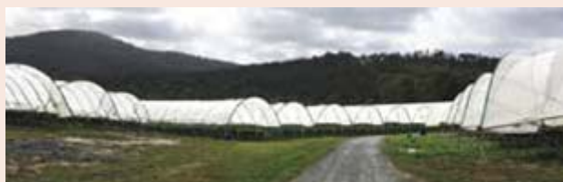
Strawberry Farm, Meander Valley TAS

This link can also now be found on our website under the resources tab.