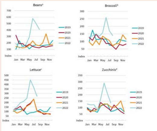
Figure 2: Wholesale price indexes. Sources ABARES, ABX