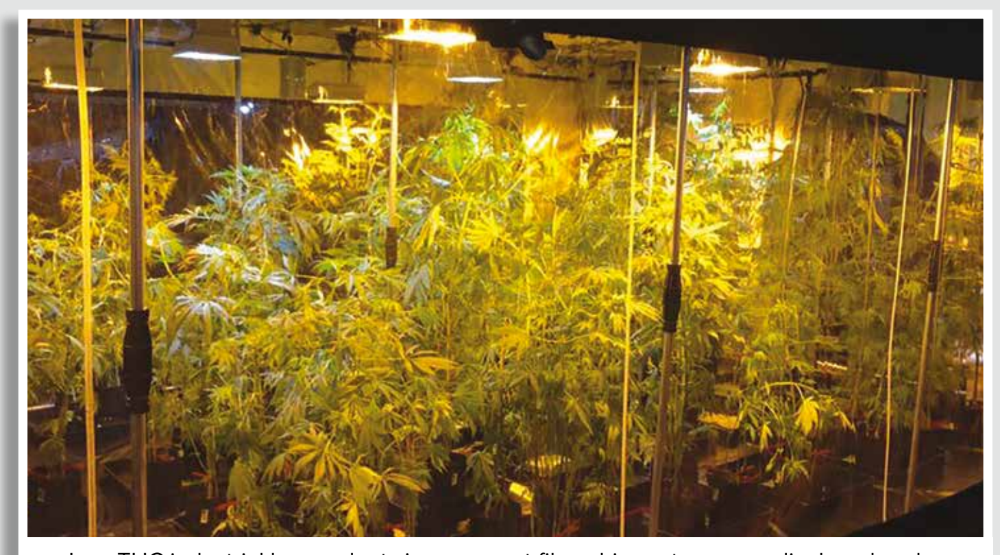
Low THC industrial hemp plants in a coconut fibre drip system were displayed under approval of the NSW Dept. of Primary Industries at the expo.

This legislation is laid over the top of all State legislation including NSW legislation, whilst Victorian