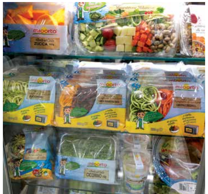
Sliced, diced, shredded or mixed vegies: it's all about convenience.

Although people's lives are very busy and they are extremely time-poor they don't want to compromise on their health and nutrition. To meet this demand, fresh, easy-to-eat pieces of fruit and vegetables prepared in snack portions were trending at Fruit Logistica. These healthy snacks are perfect to eat on the run or literally toss into a salad or meal without cutting, peeling or mess. Snack tomatoes, snack cucumbers, mini capsicums, celery, radishes, mini carrots, beans and of course berries led the fresh snack charge.