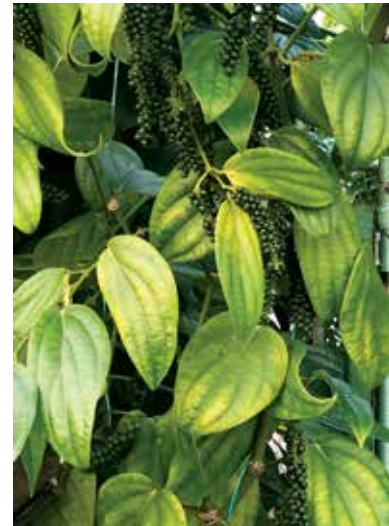
Pepper: a hot new crop under trial in Europe for the protected cropping industry.