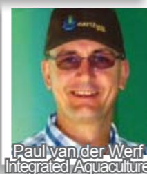
Paul van der Werf Integrated Aquaculture