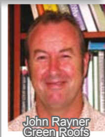
John Rayner Green Roofs