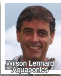
Wilson Lennard Aquaponics