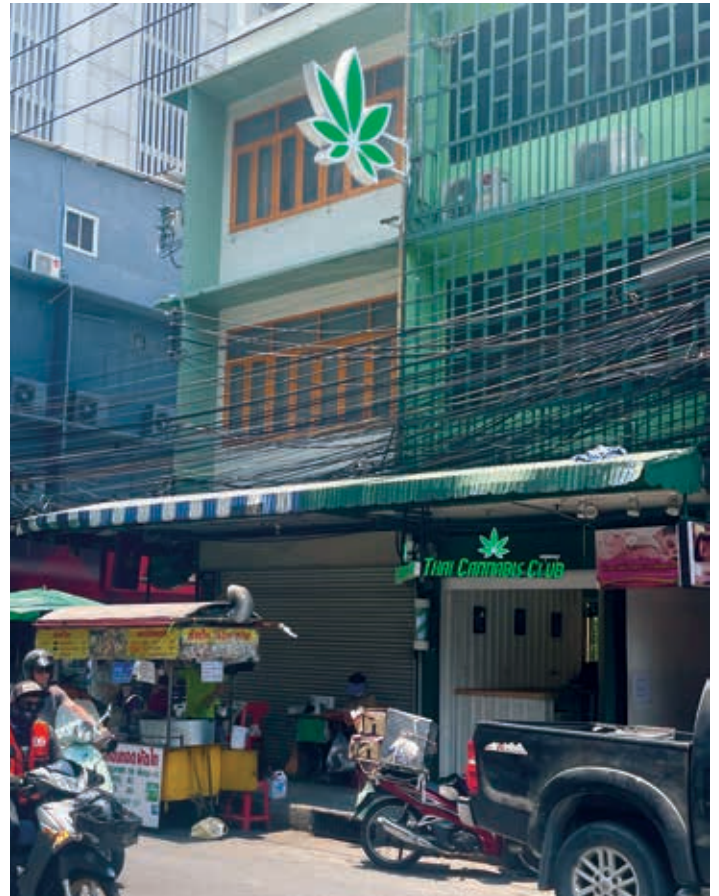
Medicinal cannabis is widely sold in small shops like these throughout Bangkok.

Plaza in Bangkok from April 6-7. It aimed to assist the emerging Thai cannabis industry by educating and connecting it to the global cannabis community. Around 200 delegates attended.